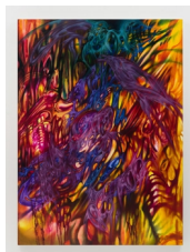
Katarina Caserman Metremaognyobena, 2022 oil on linen 165 x 120 cm, 65 x 47 \frac{1}{4} in (PH10594)