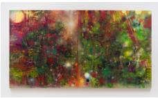
Li Hei Di Liquid meadow in the lust of dawn, 2022 oil on canvas, two parts 170 x 310 cm, 66 7/8 x 122 in (PH10606)