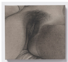
Saskia Colwell Good Girl, 2023 charcoal on linen 26 x 23 cm, 10 \frac{1}{4} x 9 in (PH10611)