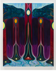
Zoe McGuire Viewing Trees, 2022 oil on canvas 152.5 x 122 cm, 60 x 48 in (PH10590)