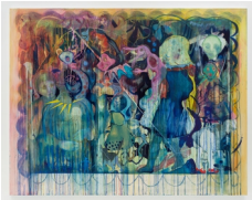
Alexis Soul-Gray What excited them most was the clown, 2022 oil, bleach, spray paint and ink on linen 160 x 200 cm, 63 x 78 3/4 in (PH10599)