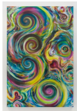
Héloïse Chassepot The goodness of the heart n°5, 2022 oil on stitched canvas 160 x 105 cm, 63 x 41 \frac{3}{8} in (PH10602)