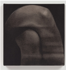
Saskia Colwell Couch A, Seat 12, 2022 charcoal powder on linen 30.5 x 30 cm, 12 x 11 3/4 in (PH10607)